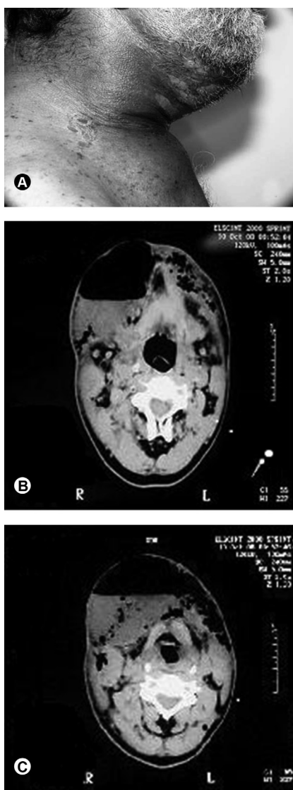
Figure 1. A: Consistent, diffuse, erythematous and vesicular swelling in the submandibular and cervical regions. B and C: CT images showing air collections in the submandibular and cervical regions.