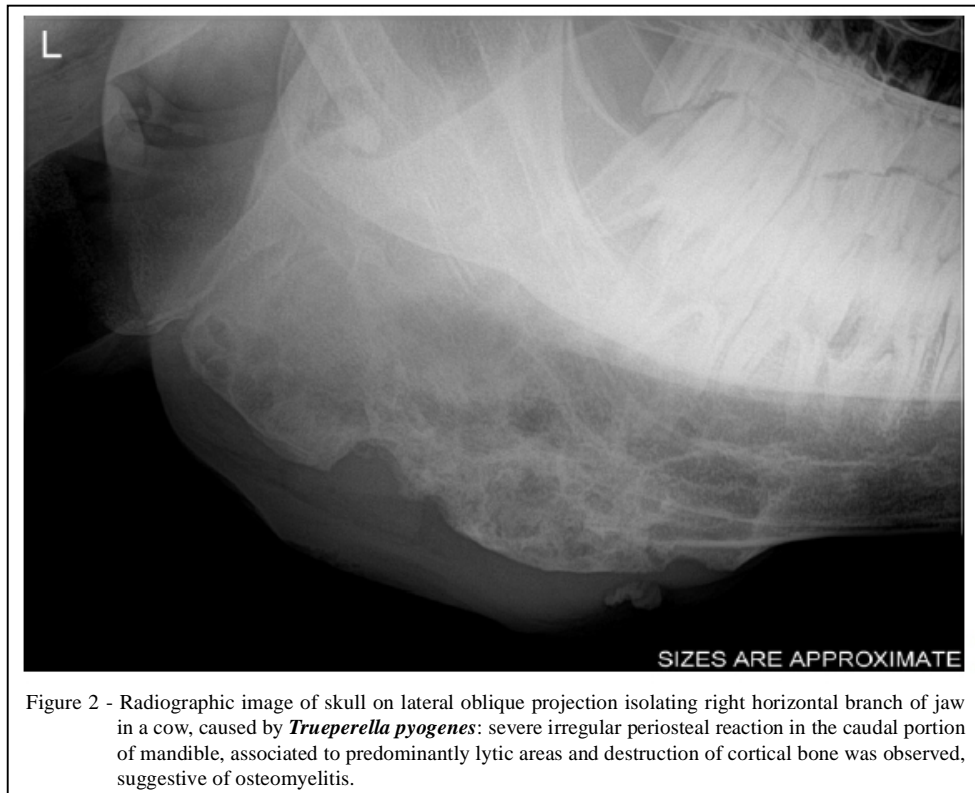
Figure 2 - Radiographic image of skull on lateral oblique projection isolating right horizontal branch of jaw in a cow, caused by Trueperella pyogenes : severe irregular periosteal reaction in the caudal portion of mandible, associated to predominantly lytic areas and destruction of cortical bone was observed, suggestive of osteomyelitis.

subjected to different phenotypic tests and substrate utilization, which allowed classification of T. pyogenes (QUINN et al., 2011).