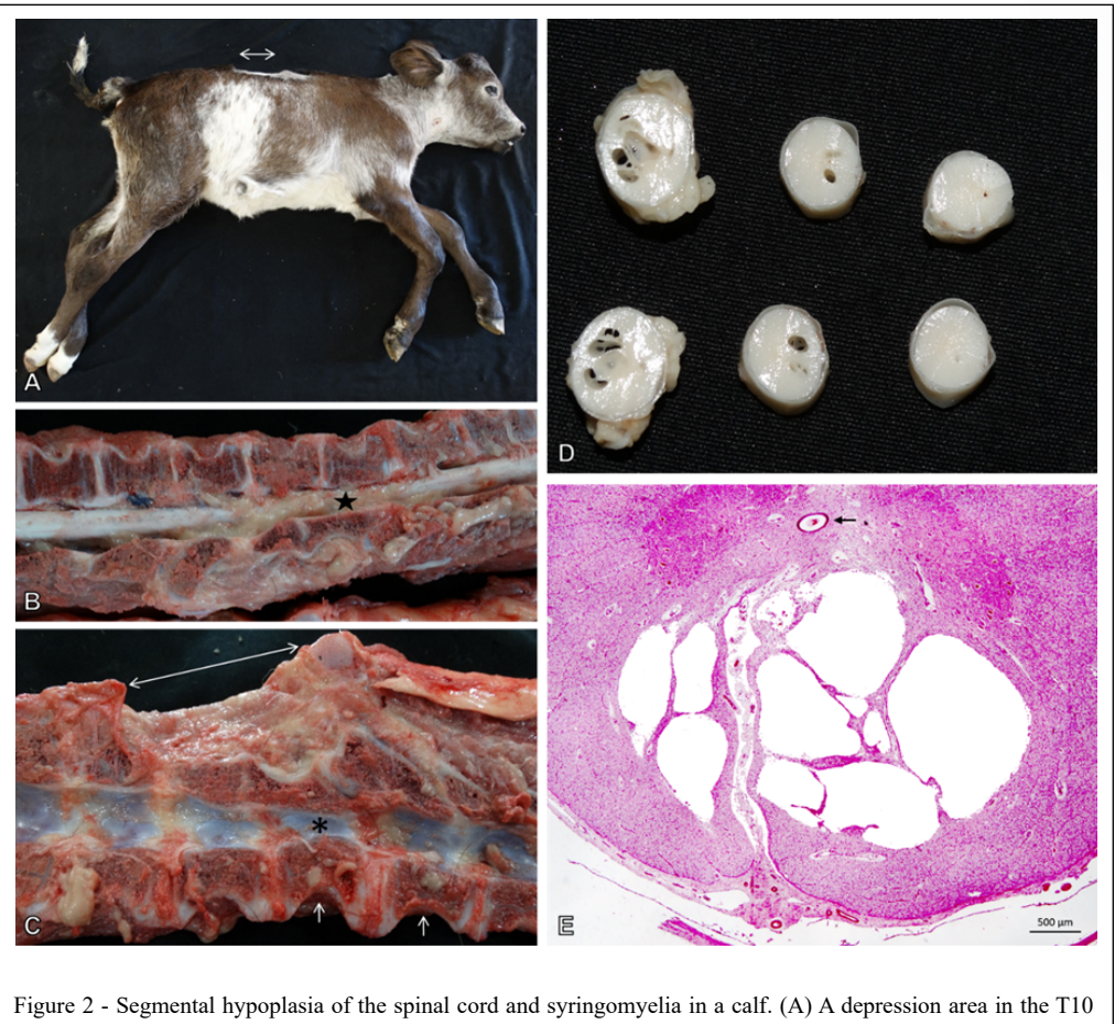
gure 2 - Segnental hypoplasia of the spinal cord and syringonyelia in a cart. (A) A depression area in the 110 and T11 thoracic regions, indicating the absence of the spinous processes (double arrow). (B) The area of spinal cord hypoplasia with adipose tissue replacing the nerve tissue (star). (C) The medullary canal with reduced diameter (asterisk), absence of the spinous processes (double arrow), and concavities in the ventral surface of the vertebrae (single arrows). (D) Transverse sections of the small-diameter hypoplastic spinal cord and cystic areas. (E) Histological examination of the spinal cord shows cysts replacing the ventral functular tissue (syringomyelia). The central canal of the medulla is usually covered by the ependyma (arrow). Hematoxylin eosin; Obj. ×2.5.

included the BVDV (PAVARINI et al., 2008; DEZEN et al., 2013) and bluetongue virus (LAGER, 2004; ANTONIASSI et al., 2010).