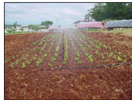
Figure 3 - Plants in the field.

- diameter at the base of the pseudostem; NL - number of expanded leaves; LA - leaf area, using the software SIARCS ® (Jorge & Crestana, 1996; Vieira-Júnior et al., 1998); RL - root length; fresh mass of the “aerial part” portion (FMAP), of the rhizome portion (FMRI) and root portion (FMRO).