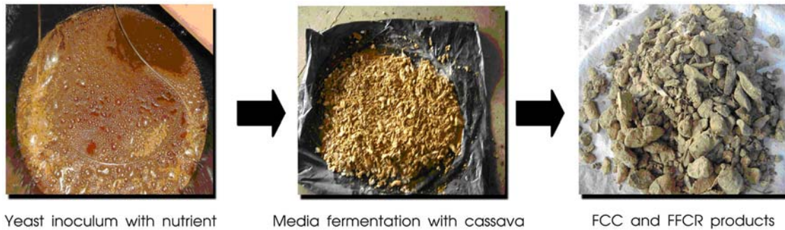
Figure 2 - Production chart for fermentation of cassava with Saccharomyces cerevisiae .