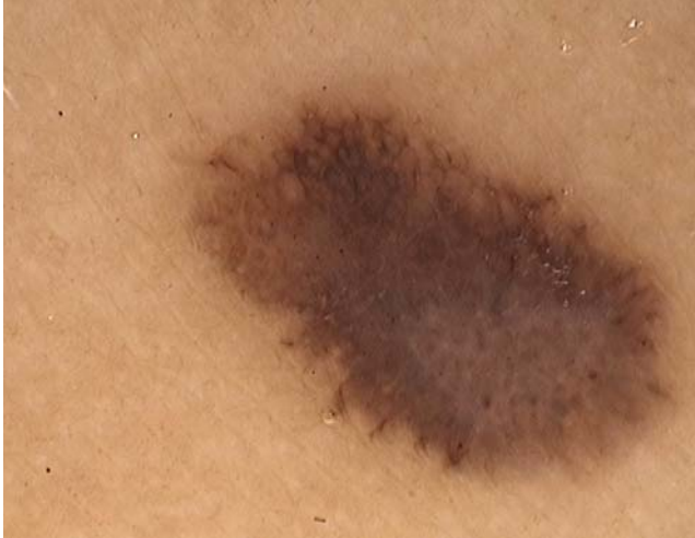
FIGURE 3: Dermoscopy, magnification 30x

negative pigment network at the center of the lesion and areas resembling a bluish-white veil (Figures 2 and 3). Histopathology showed nests of fusiform cells at the epidermal base and in the dermis (Figure 4).