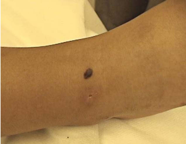
FIGURE 1: Clinical appearance. Hyperchromic papule of 8 mm in diameter