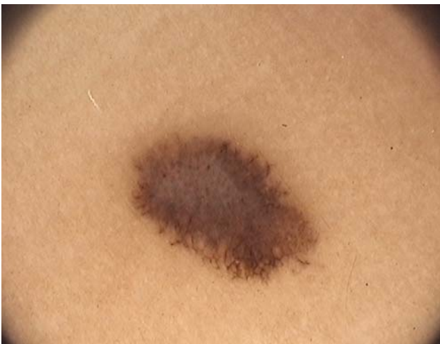
FIGURE 2: Dermoscopy, magnification 20x. Nonspecific global pattern with the presence of atypical striations (irregular distribution and dimensions), the presence of a negative pigment network at the center of the lesion and areas resembling a bluish-white veil

Dermoscopy aids in the diagnosis of cases of Spitz nevus with a starburst or globular pattern; how-