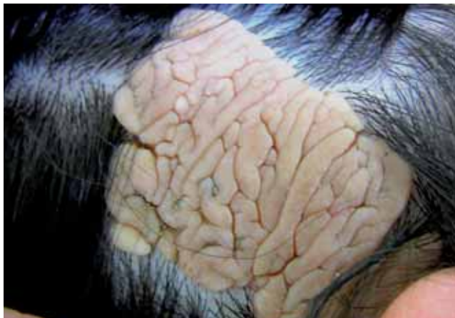
FIGURE 1: Beige colour plaque with fibroelastic consistency, velvety in appearance, alopecic, with clearly defined limits and sulci or well-marked meandering invaginations and a cerebriform appearance on the upper part of the right ear