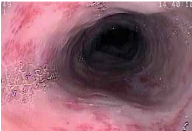
FIGURE 3: Esophagus: telangiectasias covering the entire mucosa without evidence of bleeding in upper gastrointestinal endoscopy