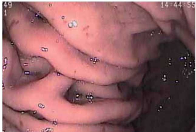
FIGURE 4: Stomach: angiomatous lesions visualized in all segments of the organ

In the gastrointestinal tract, manifestations include telangiectasias, AVMs and varicosities, which can lead to upper gastrointestinal bleeding, liver dysfunction and encephalopathy. Bleeding tends to be recurrent and progressive, usually occurring after 40 years of age. 1