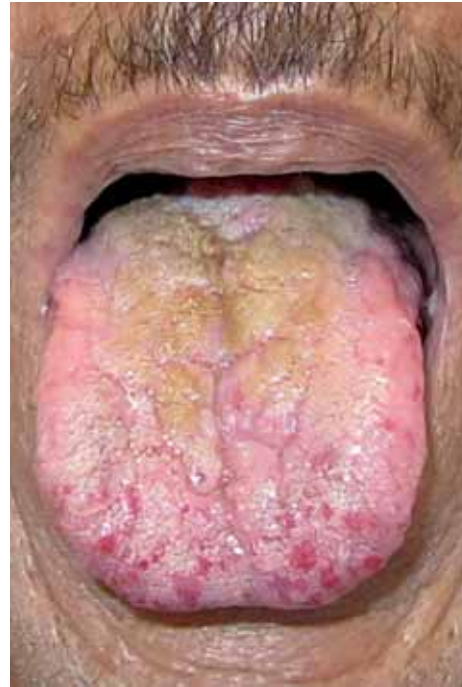
FIGURE 1: Angiomatous papules affecting the tongue

Complications in the central nervous system (CNS) vary from transitory ischemic events to an