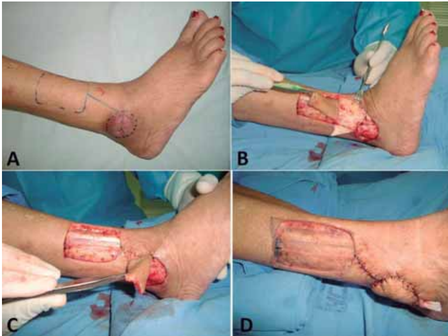
FIGURE 5: A) schematic drawing of the reverse-flow supramalleolar flap, B) the making of the flap according to the surgical plan, C) rotation of the flap for coverage of the surgical wound, D) partial skin graft coverage of the flap donor site