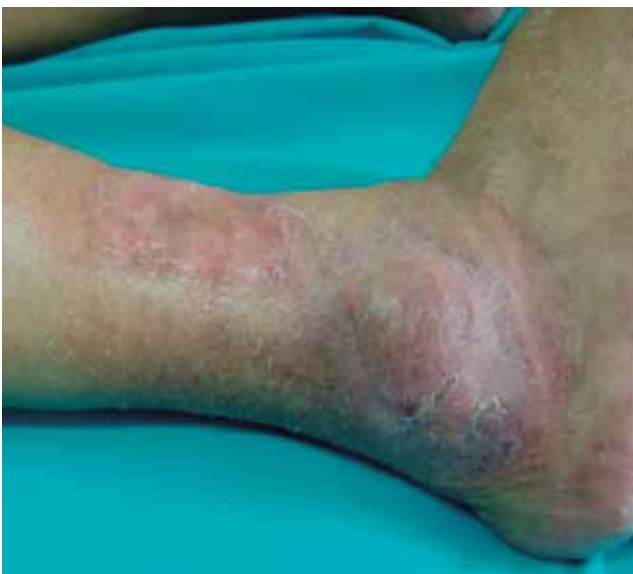
FIGURE 6: result observed three months postoperatively

findings, also called syringofibroadenomatosi; (iiii) Nonfamilial unilateral linear ESFA, also referred to as nevoid ESFA, and (iiiii) reactive ESFA, associated with inflammatory or neoplastic dermatoses, such as erosive lichen planus, bullous pemphigoid, burn scar, squamous cell carcinoma and chronic diabetic foot ulcer. 2,4,5 The case reported here was classified as solitary ESFA, because it was a single lesion on one of the extremities of an elderly patient.