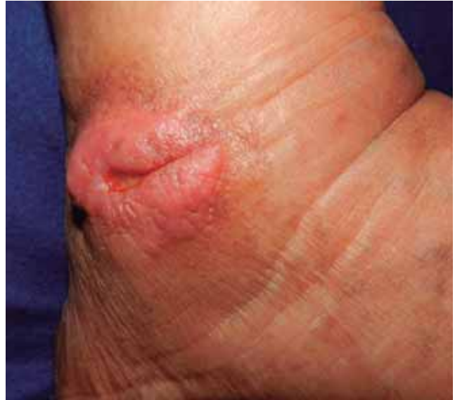
FIGURE 2: Tumor in greater detail, showing its granular surface and ill-defined edges.