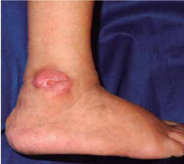
FIGURE 1: Erythematous tumor with a small central ulceration on the right lateral malleolus