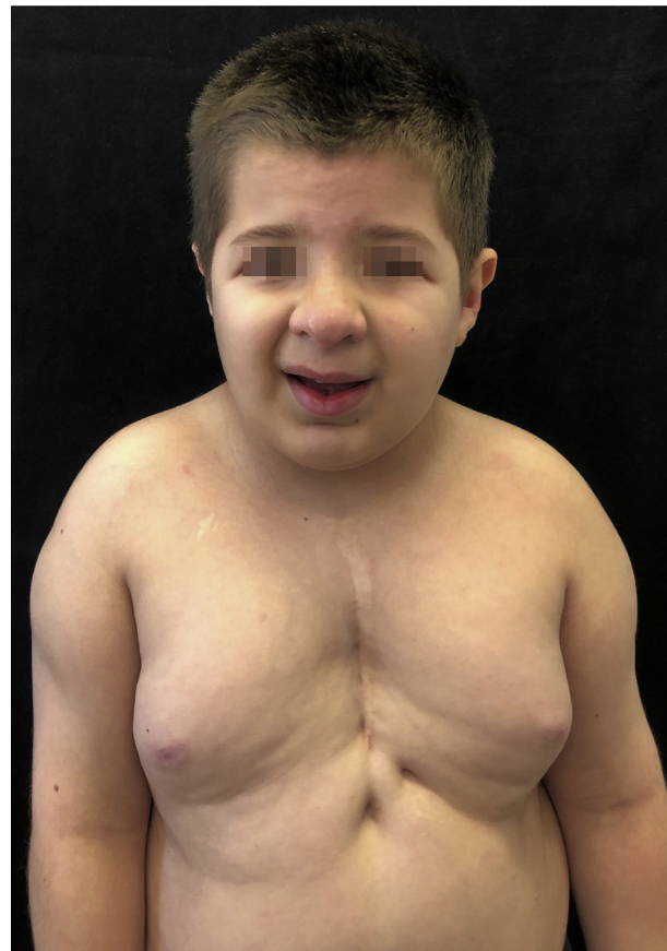
Figure 1 Twin 1 with slanting eyelid slits, discrete micrognathia, prominent auricular helices, nipple hypertelorism, sternal scar secondary to cardiac surgery to correct interventricular communication, wide thumbs and radial deviation.