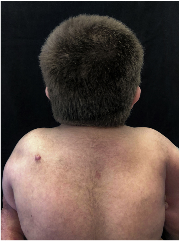
Figure 2 Normochromic nodular lesion in the left scapular region which was excised. Mild hypertrichosis on the dorsal spine and shoulders.