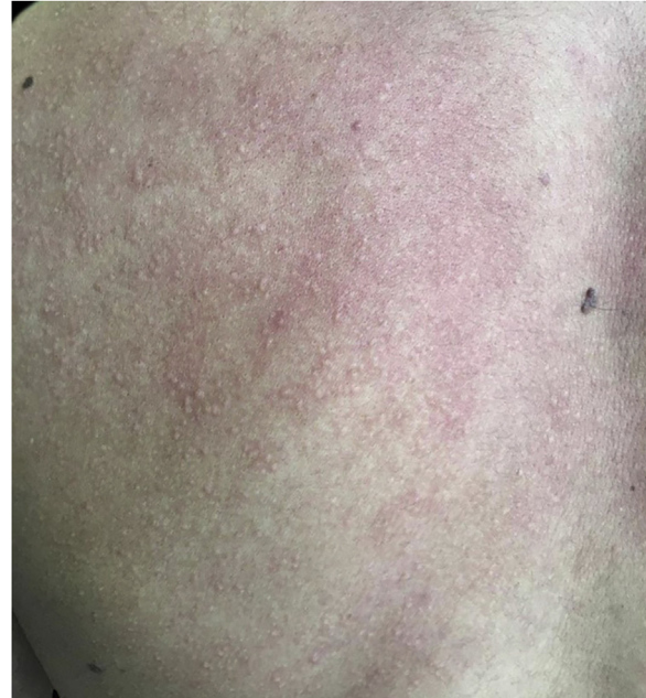
Figure 1 Several normochromic papules and erythema induced by physical activity.

AGIA clinically presents as the absence of sweating after stimulation. The symptoms of heat intolerance and cholinergic urticaria are associated, corroborating the predominance in individuals whose work activity involves exposure to heat. Preserved palmoplantar and axillary