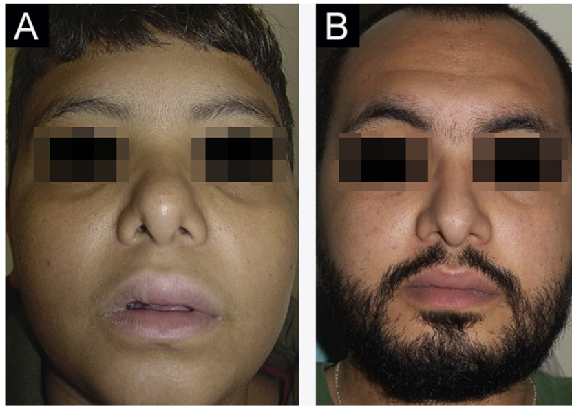
Figure 3 (A), Case 4 – diffuse facial edema. (B), Same patient, as an adult – complete resolution of edema.