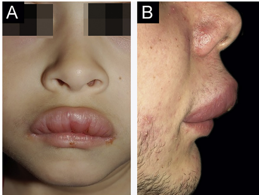
Figure 1 Clinical characteristics of cases 1 and 2. (A), Case 1 – macrocheilia. (B), Case 2 – macrocheilia.