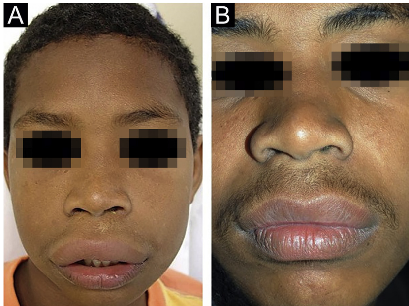
Figure 4 (A), Case 5 – macrocheilia. (B), Same patient, as an adult after several surgical procedures.