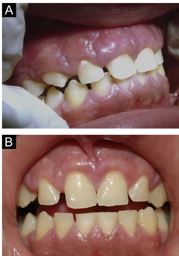
Figure 7 (A), Patient 4 - granulomatous gingivitis. 10 (B), Same patient after gingivoplasty.