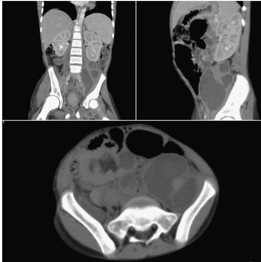
Fig. 2 – Abdominal computerized tomography showing multiple retroperitoneal lymphadenopathies.