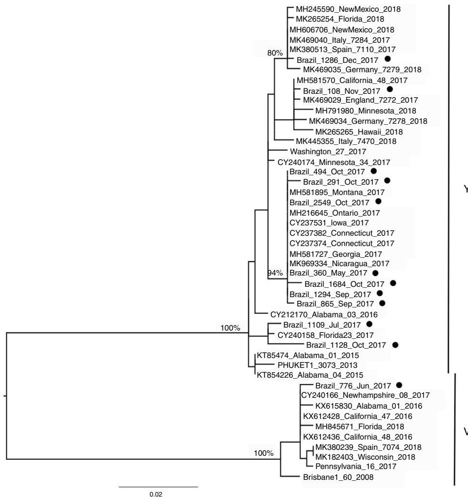
Fig. 2 – Maximum likelihood phylogenetic tree of influenza B HA. Black dots demonstrate the clinical samples from this study. Yamagata lineage and Victoria lineage are indicated by Y and V letters aside the respective clusters. Bootstrap values above 80% are depicted in the key nodes.

and advised to seek medical attention sooner than the general population.