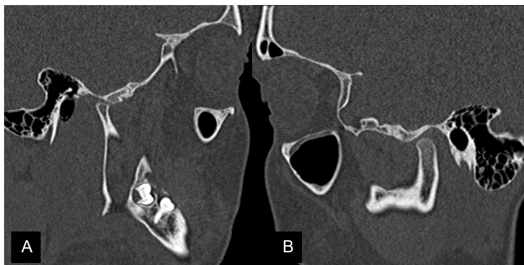
Figure 2. Computed tomography showing the condylar hypoplasia of the right side. Both condylar processes are presented previously the mandibular fossa. There is also flattening of the condyle, glenoid fossa and articular eminence of the affected side; A- Sagittal cut of the right side and B-Sagittal cut of the left.