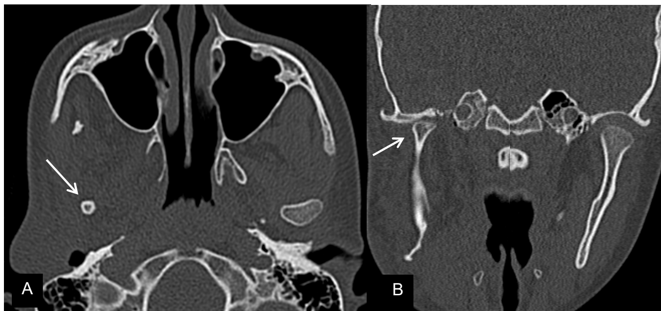
Figure 1. Computerized Tomography showing the condylar hypoplasia of the right side (indicated by arrows). Note the appearance of normality of the left condylar process; A- Axial cut and B- Coronal cut.

limb shortening of the affected side jaw and the consequent developmental defect of the mandibular body. However, on the left side, all articular bone components were within the normal aspect (Figures 1 to 3).