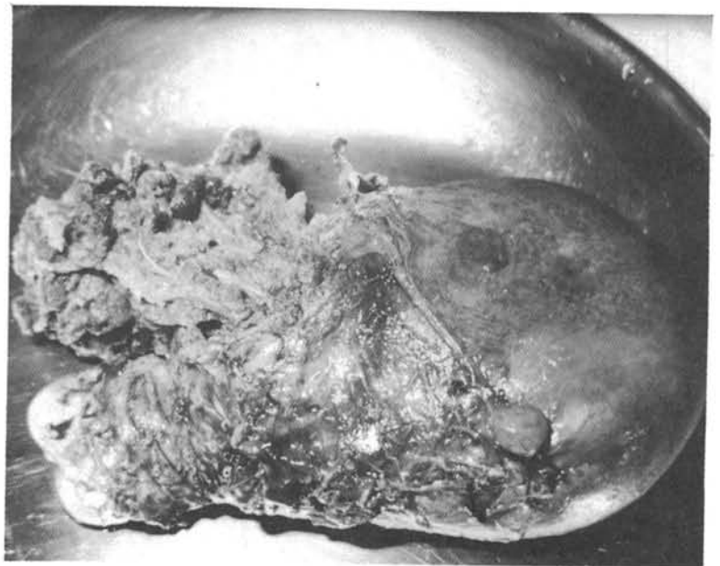
Figure 3 - Uterus with rupture and placenta.

A conservative approach to chemotherapy, such as methotrexate, is a relatively new and has not been tested. Its effectiveness has not yet been proved with placenta percreta; however, its results with ectopic pregnancies show that it may be a viable procedure, as long as precautions are taken and a careful follow-up during pregnancy occurs, especially in patients who wish to remain fertile.