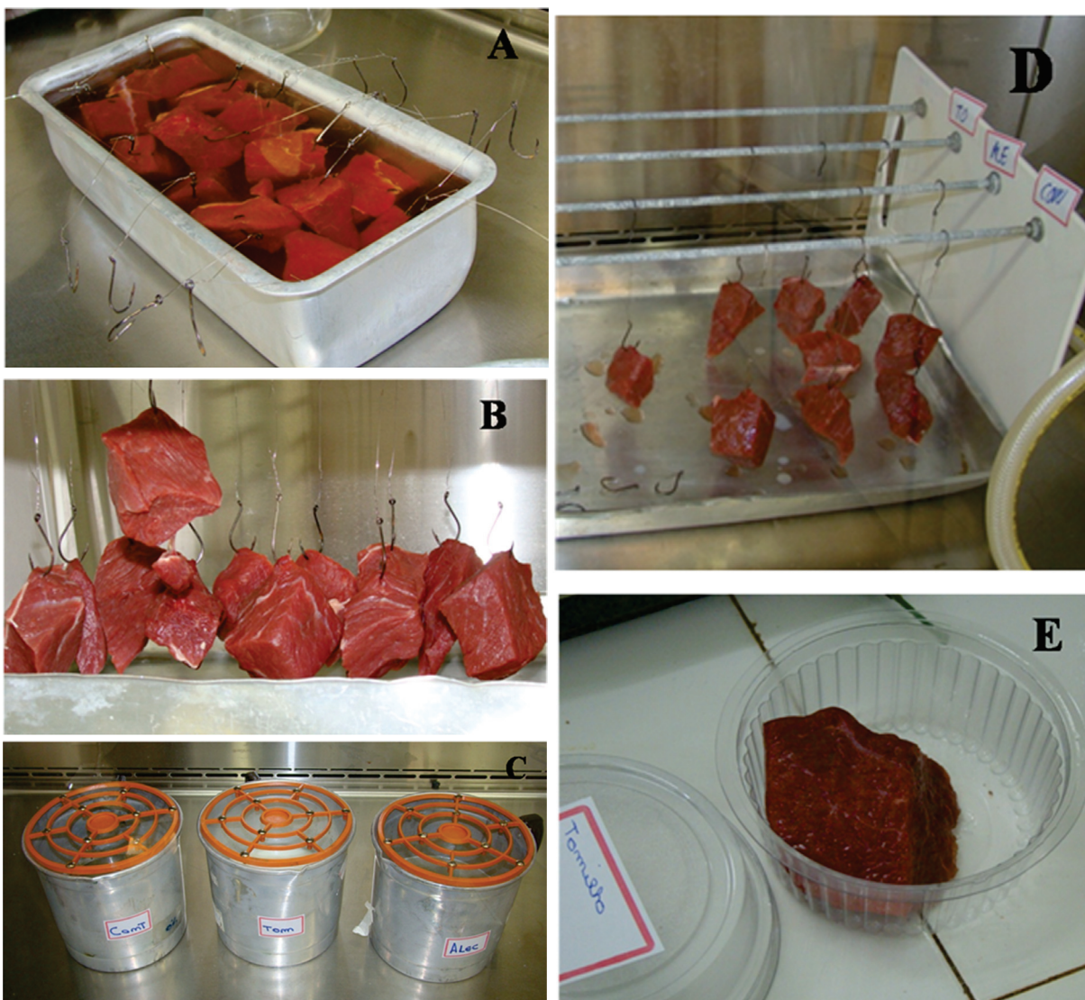
Figure 1 - Main stages of the experiment that evaluated the antibacterial activity of edible gelatin coatings containing essential oils (EOs) of Thymus vulgaris and Rosmarinus officinalis against Listeria monocytogenes inoculated in raw beef pieces. (A) L. monocytogenes inoculation in raw beef pieces. (B) Drying of the raw beef pieces after the bacterial inoculation step. (C) Recipients containing the edible coating solutions of gelatin, from left to right: solution without the addition of EOs, solution containing T. vulgaris EO, solution containing R. officinalis EO. (D) Drying of the raw beef pieces after the edible coating application. (E) Raw beef piece with the application of edible gelatin coating containing T. vulgaris EO inside a polyethylene terephthalate packaging, after 1 hour storage at 7 °C.

(Himedia®, Mumbai, Maharashtra, India), and the incubation was conducted at 37 °C/24 hours.