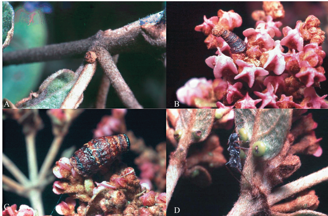
Figure 1. Egg (A) of C. minax and the first (B) and third (C) larval stage feeding on buds of the host plant H. pteropetala . Camponotus crassus Mayr (D) feeding on an extrafloral nectary of H. pteropetala .