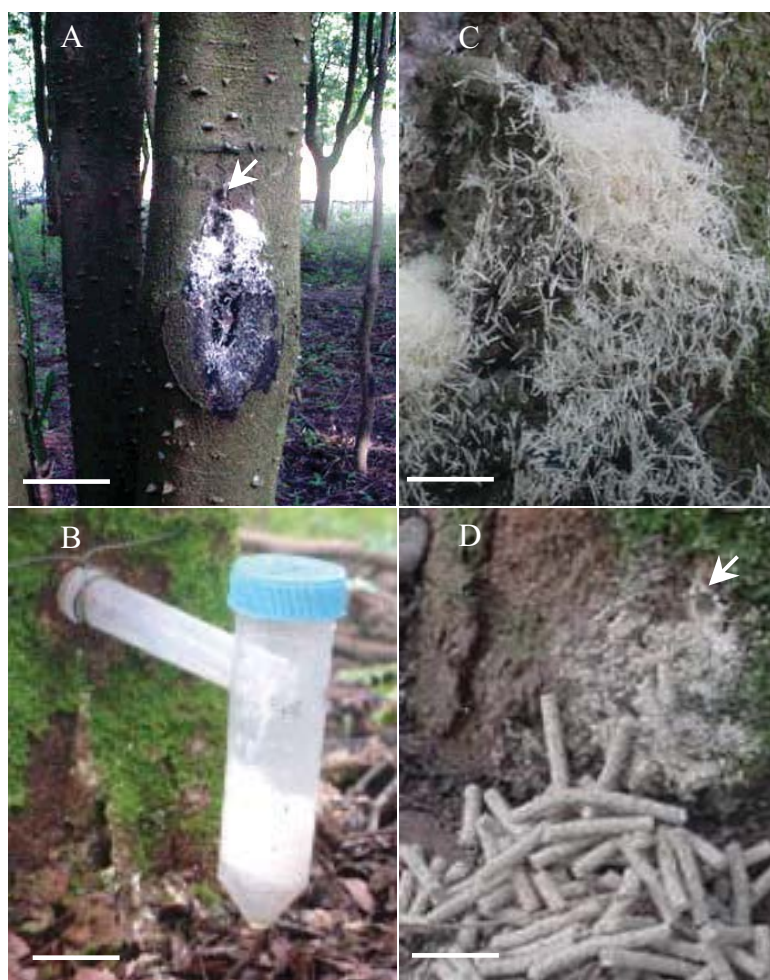
Fig. 1. Infestation of C. echinata by P. mutatus . A – View of a trunk with hole (arrow) and imago sawdust, bar = 8.3 cm; B – Trap hold in the trunk, adapted from Santoro (1962), bar = 3.2 cm; C – Imago sawdust, bar = 0.5 cm; D- Hole (arrow) and larval sawdust, bar = 1.2 cm.

Infestation was observed in trees with D.B.H.(diameter at breast height) greater than 0.15 m. One to six holes were found per trunk, ranging from 0.2 m to 2.9 m from the tree's base. The infestation level of the brazilwood trees by P. mutatus was low (ca. 3%, Fig. 2). This level of infestation is