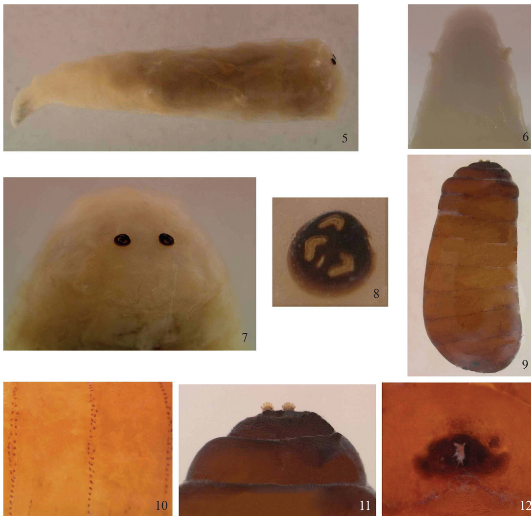
Figs. 5-12. Philornis fasciventris . Fig. 5) larva: general aspect; Fig. 6) larva: anterior end with anterior spiracles; Fig. 7) larva: posterior end; Fig. 8) larva: posterior spiracle and spiracular slits; Fig. 9) puparium: general aspect; Fig. 10) puparium: detail of spiracles ; Fig. 11) puparium: anterior end; Fig. 12) puparium: caudal segment, anal region.

spiracles (closer to each other in P. aitkeni , separated by about the width of one spiracle, while in P. fasciventris they are separated by a distance of two spiracles). The arrangement of the spines and the shape of the posterior spiracular slits are also very similar.