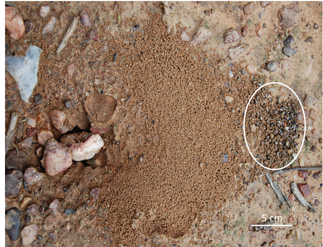
Fig 1 A Pheidole fallax nest area in the caatinga vegetation, northeast Brazil. A white circle highlights a well-delimited refuse pile with a concentration of Croton sonderianus seeds.

In the rainy season of 2009, we assessed 20 nests of P. fallax sizing up to 2100 cm 2 (calculated as an ellipsoid). Each nest area consisted of a nest entrance, a nest mound and a spatially well-delimited and dense seed pile created by ant deposition (Fig 1). We collected