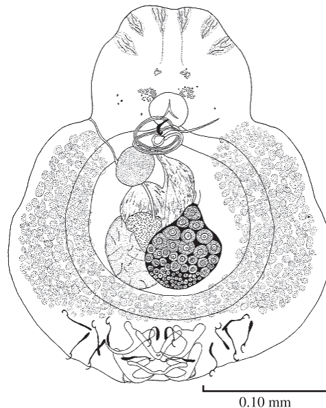
Figure 1. Apedunculata discoidea gen. n., sp. n. Composite drawing of whole mount (ventral view).