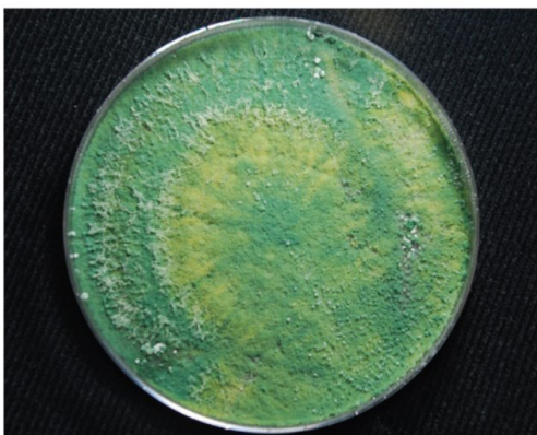
Figure 1. Trichoderma isolates collected in Brazil. (A) Isolate T. harzianum ALL-42 grown on PDA (Potato Dextrose Agar) medium; (B) Isolate T. asperellum T-00 grown on PDA (Potato Dextrose Agar) medium.