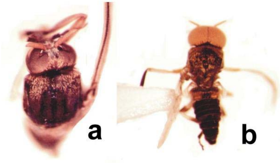
Fig. 18. Simulium friedlanderi . a. Female. b. Male.