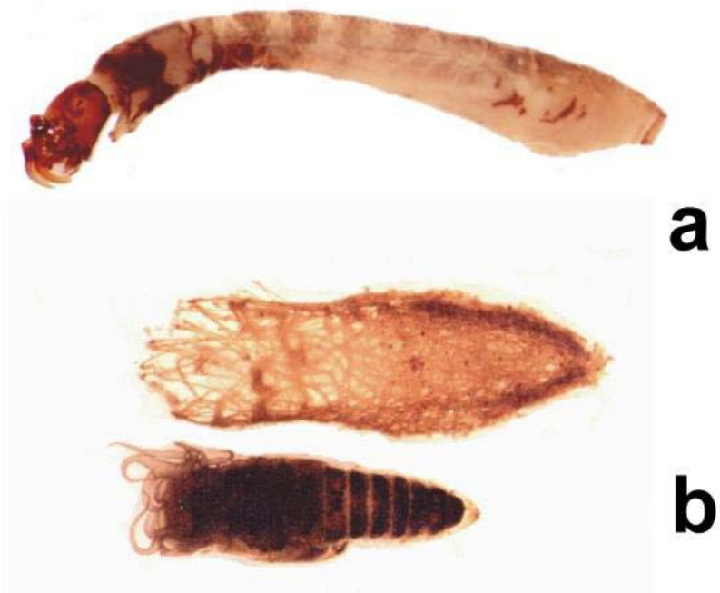
Fig. 17. Simulium friedlanderi . a. Larva. b. Pupa and cocoon.