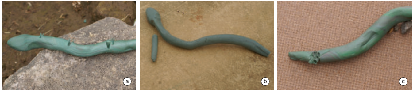
Figure 2. General aspect of imprints of predatory attacks to artificial snakes. a) beak imprint; b) laceration; c) scratch.