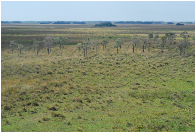
Figure 2. The studied forest islets are inserted in a matrix mainly composed by herbaceous and shrubby species that grow in the seasonally flooded grasslands in the Pantanal, Brazil.

We recorded 187 flowering species, of which 63 species, belonging to 26 plant families, were recorded as being visited by native and exotic bees Apis mellifera . Asteraceae and Fabaceae presented the highest number of visited species, with eight and seven species, respectively, followed by Malvaceae and Rubiaceae (five species each) and Lamiaceae and Verbenaceae (four and three species, respectively). Concerning plant habit, most species visited by bees were herbs (52%), followed by trees (19%), shrubs (13%), liana (9%) and sub-shrubs (6%). A mean of 22 ( \pm 5.65 ) visited plant species was recorded per month. The lowest number of blooming plants was recorded in March (10), compared to the highest number recorded in November and December (28 each month). The plants visited by the highest number of bee species were ruderal, such as Hyptis suaveolens (L.) Poit. (18 species), Centrosema brasilianum (L.) Benth. (seven species), Sphagneticola brachycarpa Pruski (six