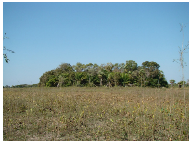
Figure 1. Studied natural patch of forest vegetation (forest islet). Vegetation of fragments is primarily composed of riparian forest and Chaco species at the edges, and species typical of deciduous and semi-deciduous forests in its central portion, São Bento ranch, Pantanal, Brazil.

We collected bees and flowers at the edges of the forest islets through two to four - day expeditions per month. Due to access difficulties during the flooding period, when the road access and some areas around of the studied islets remained flooded, some of the chosen forest islets could not be sampled every month. As a result, two forest islets were sampled for 12 months (September/2006-August/2007), another two islets for four months (September to December/2006), other two only during three months (September