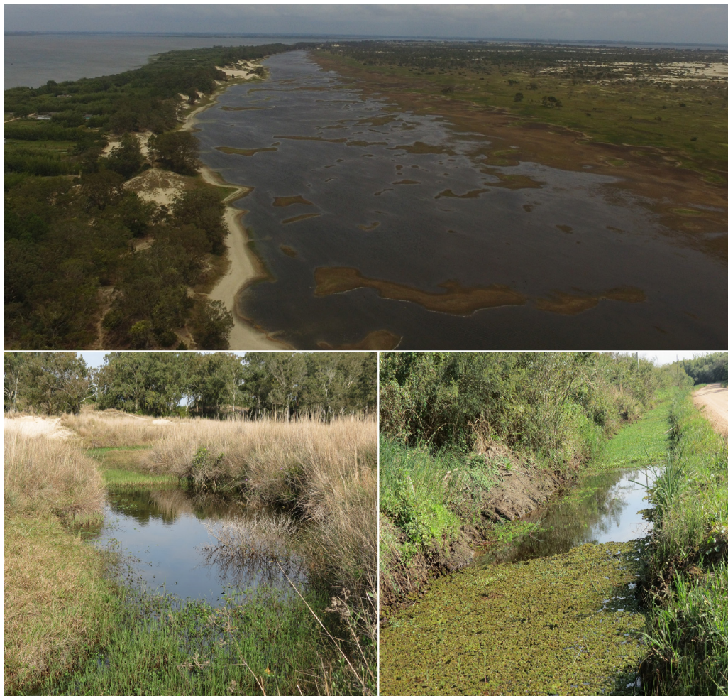
Figure 2. Limnic systems sampled in Marinheiros Island, Patos Lagoon estuary, southern Brazil: shallow lagoon “Lagoa do Rey” (above), set of pools of “Marambaia” (below, left); pluvial channel (below, right).