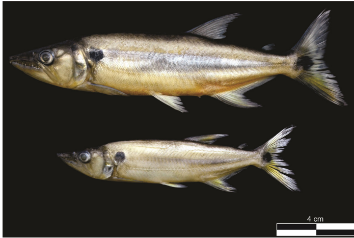
Figure 3. Specimens of Acestorhynchus pantaneiro (above CIFURG 200, below CIFURG 201) collected in Marinheiros Island, Patos Lagoon estuary, southern Brazil.

None of the recorded species is considered as threatened in Rio Grande do Sul (FZB 2014) and Brazilian (MMA 2014) lists.