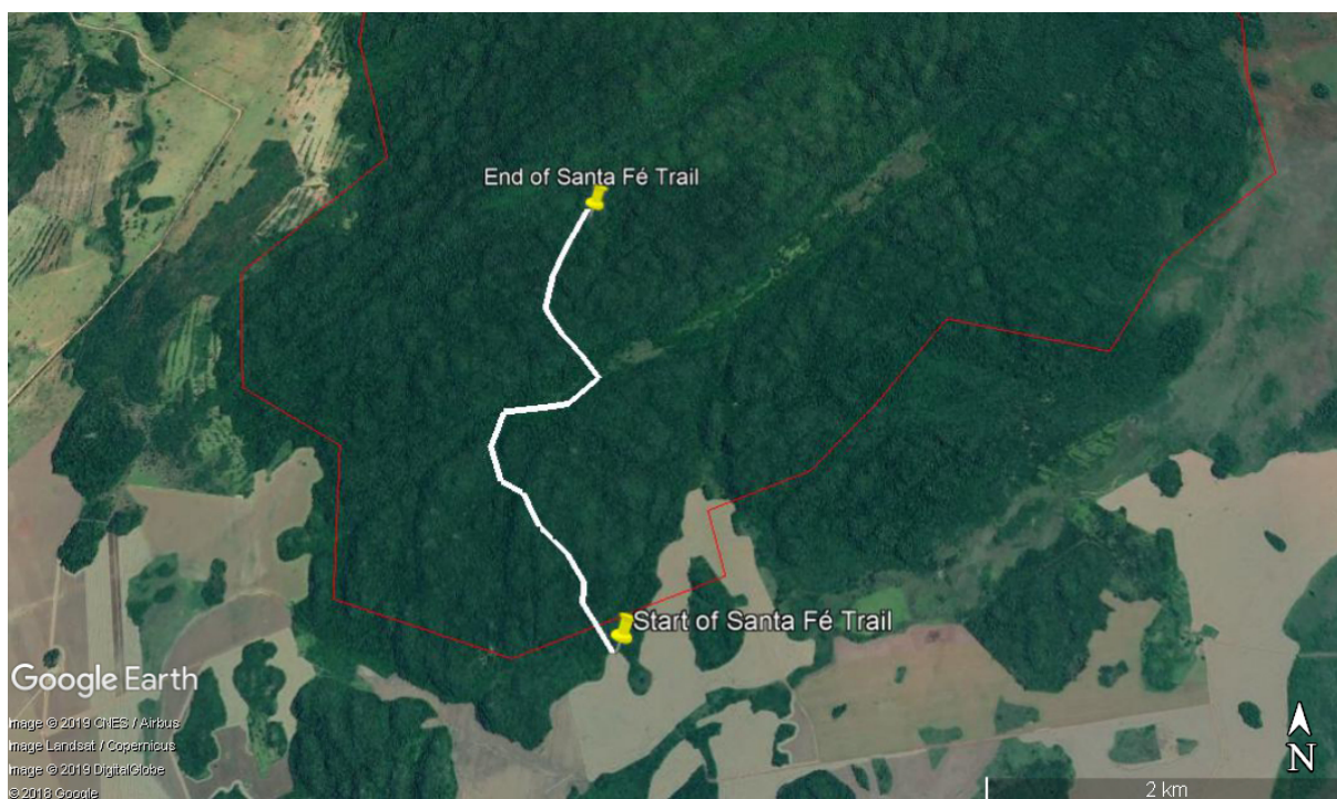
Figure 2. Santa Fé Trail in the Parque Nacional da Serra da Bodoquena, Mato Grosso do Sul state, Brazil, periodically used to monitor the flora and fauna (Source: Google Earth, 2019).