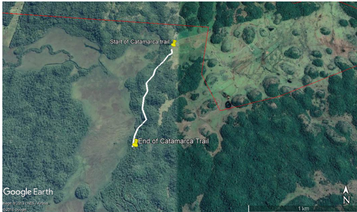
Figure 3. Catamarca Trail in the Parque Nacional da Serra da Bodoquena, Mato Grosso do Sul state, Brazil, used to monitor periodically the flora and fauna.

The larvae were daily collected from the trays and placed into clear acrylic cups containing sterilized sand, where they remained until the adult emergence of the fruit flies and/or their parasitoid species.