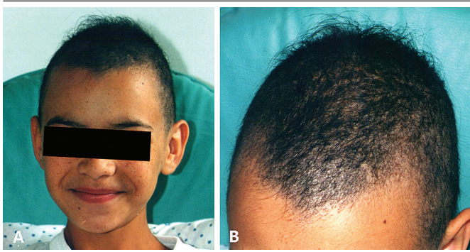
FIGURE 2 – Images of the patient at 10 years of age showing diffuse and irregular alopecia with hair rupture at different levels, giving an appearance of hypotrichosis (A and B)

The dermatological findings of our patient (with presence of sparse hair due to hair disruption) associated with her light microscopy findings (the beaded appearance due to regularly spaced nodes) were compatible with the diagnosis of monilethrix. Nail and skin changes, as onychodystrophy, keratosis pilaris and follicular keratosis, are also common (7,8) , although they were not verified in our patient. Monilethrix is caused by heterozygous and point mutations in hair cortex-specific keratin genes, all located on 12q13.13: KRT81 , K83 and KRT86 (1) . Mutations in these genes affect hair stability (2) , because they interfere in the formation of the intermediate keratin filament present in the cortical capillary rod. However, the specific reason for hair shaft diameter changes in patients with monilethrix is still unknown. The pattern observed in our family was autosomal dominant, which is consistent with almost all cases of the disease. On the other hand, there is a case described in literature presenting DSG4 mutation and an autosomal recessive form of the disease (9) . Determination of the inheritance pattern has important repercussions on the risk of recurrence for future pregnancies. Affected individuals have a 50% risk of transmission to their children, what impacts on appropriate genetic counseling (3) .