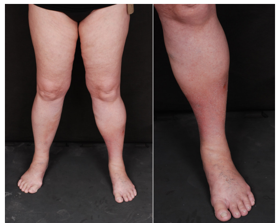
Figure 1. Erythema, edema, infiltration and areas of fibrosis, predominantly involving the distal part of the left lower limb.

A duplex scan of the LL conducted in May of 2015 showed bilateral partial great saphenectomy, bilateral segmental small saphenous vein incompetence, insufficient tributary and non-tributary veins, insufficient perforating veins, and lymphedema, while the deep vein system was patent and competent. Histopathology of the lesion revealed dermis with discrete perivascular and interstitial lymphocytic-histiocytic inflammatory infiltrate and myxoid edema. The hypodermis had septal neovascularization and sporadic foam histiocytes. In view of the history and physical examination findings, associated with the laboratory results that did not suggest a specific diagnosis of other types