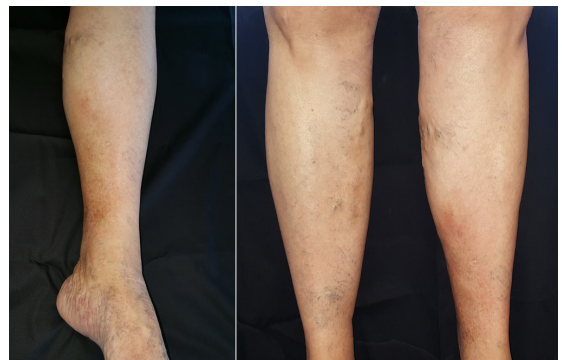
Figure 3. In January of 2018, it was observed that the condition had resolved completely. The patient stated that the pain had regressed totally.