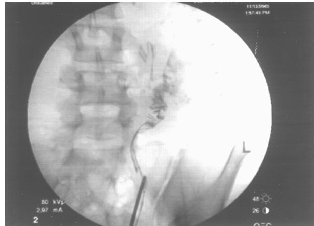
Figure 2 – Left retrograde injection of contrast medium demonstrating extravasation into the peritoneum.

Based on the intraoperative findings of this case, we concede that the titanium clips on the ureteral stump suddenly dislodged during convalescence, resulting in only antegrade ureteral bleeding. Clip slippage is a well-known occurrence, especially during ligation of vessels (2). However, slippage from the ureter has never been reported. Alternatives to titanium clips include locking clips, staplers, suture, cautery, and various vessel-sealing systems. We now ligate the ureter with plastic locking clips during laparoscopic nephrectomies.