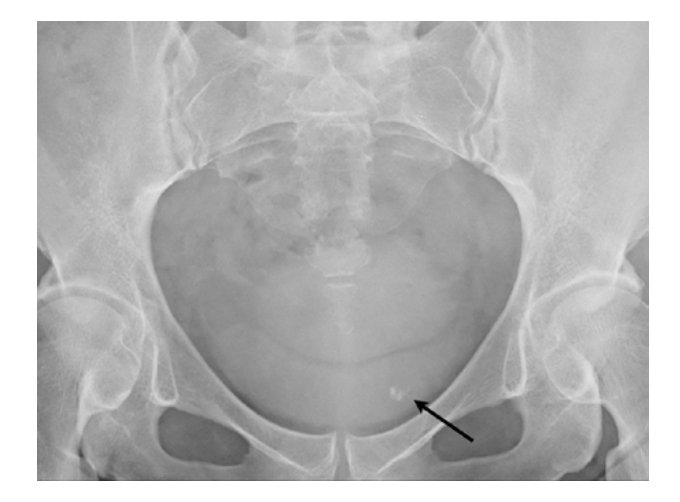
Figure 1 - The plain KUB at postoperative 29 months showed a small irregular round radiopaque material (black arrow) at left lower pelvis which was not seen on the postoperative 1 week film (not shown).

mesh repair is not exactly known, with higher reported rate in synthetic material (2-4). The definite diagnosis of urinary bladder foreign body is made by cystoscopy, and endoscopic or surgical removal of the foreign body effectively cure the symptom (1). However the diagnosis is usually delayed with the median of 24 months after the original surgery, because the presenting symptoms are variable and confused with recurrent SUI or post-sling obstruction symptoms (1-3,5-7). This is the first report of the imaging findings of urinary tract injury following SUI surgery. In patient with previous history of pelvic surgery, calcified urinary tract foreign body on CT should alert the present of iatrogenic injury.