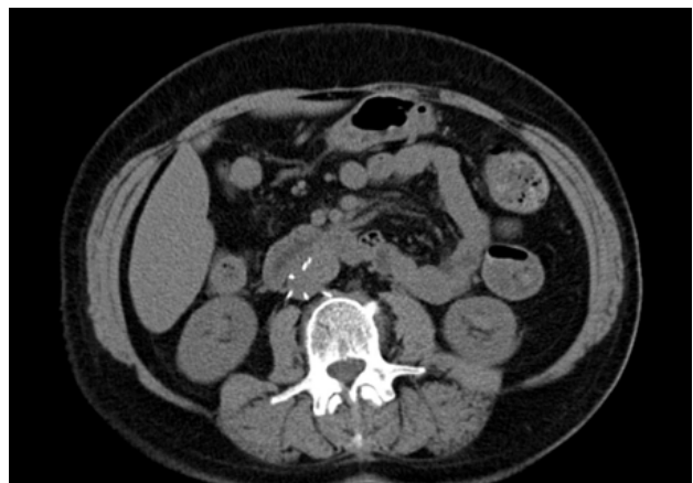
Figure 1 - CT scan image of IVC filter.

This CT image notes an IVC filter in the region of the gonadal vein and renal veins. Protruding prongs can be noted posteriorly.