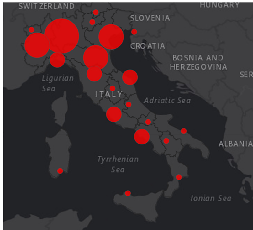
Figure 3 - Distribution of COVID-19 cases in Italy (3).

πειρα σφαλερή, ή δέ κρίσις χαλεπή” “Vita brevis, ars longa, occasio praeceps, experimentum periculosum, iudicium difficile”, we think residents should play an active role alongside the specialist by exploiting the pandemic as an unrepeatability opportunity from which to learn upon (22). In general, the COVID-19 emergency is a highly dynamic situation and the burden on the healthcare system varies daily according to the geographical region.