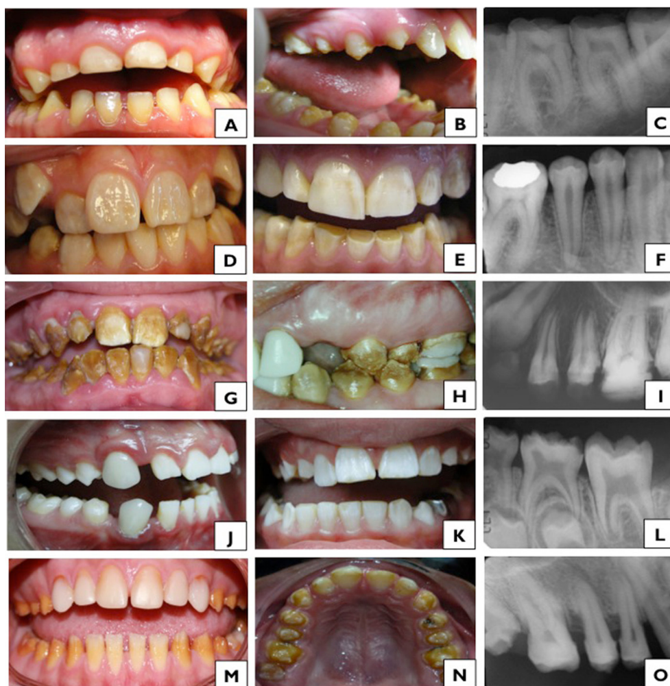
Figure 2- Clinical subtypes of Amelogenesis Imperfecta found in this study; A, B, C: Clinical subtype of Hypoplastic Amelogenesis Imperfecta; D, E, F: Subtype of Hypomature AI; G, H, I: Subtype of Hypocalcified AI; J, K, L: Subtype of Hypomature-hypoplastic AI; M, N, O: Subtype of Hypocalcified-hypoplastic AI

radiographic signs associated with different subtypes of AI was the motivation for the development of this study, in which 121 individuals belonging to 41 Chilean families were evaluated from a clinical, radiographic and genealogical point of view.