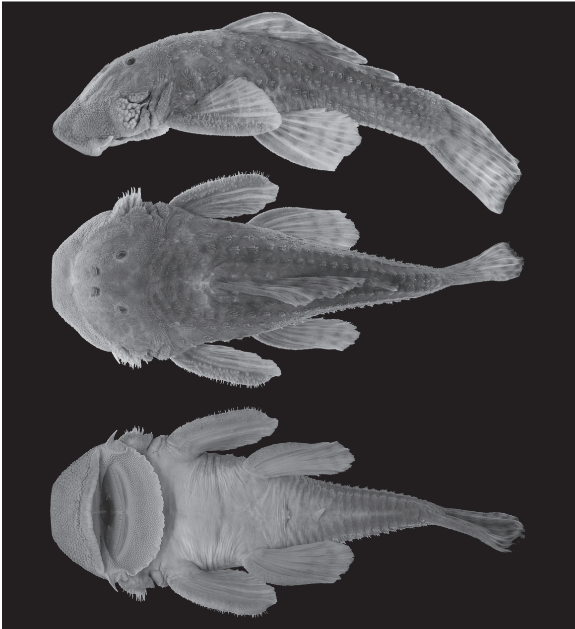
Fig. 1. Chaetostoma spondylus , new species, MUSM 33341, holotype, 119.7 mm SL, Peru, Departamento de Cajamarca, Celendín, Sorochuco, río Sendamal, tributary of río Marañón, Amazon basin.