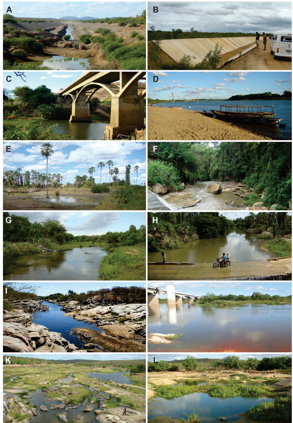
FIGURE 2 | Sampling sites in the São Francisco Interbasin Water Transfer Project basins in the Brazilian semiarid. A = Canals under construction near the rio São Francisco main channel, and B = near Sertânia, Pernambuco State (PE), C = Rio Pajeú, tributary of the São Francisco basin, PE, D = Rio São Francisco near Petrolina, PE, E = Temporary pool in rio Jaguaribe basin in Russas, Ceará State (CE), F = Rio Jaguaribe in Crato, CE, G = Rio Apodi-Mossoró in Pau dos Ferros, Rio Grande do Norte State (RN), H = Rio Apodi-Mossoró in Pau dos Ferros, RN, I = Rio Seridó, tributary of the Piranhas-Açu basin in Caicó, RN, J = Rio Piranhas-Açu, Jardim de Piranhas, RN, K = Rio Paraíba do Norte in Barra de Santana, Paraíba State (PB), L = Rio Paraíba do Norte in São João do Cariri, PB.