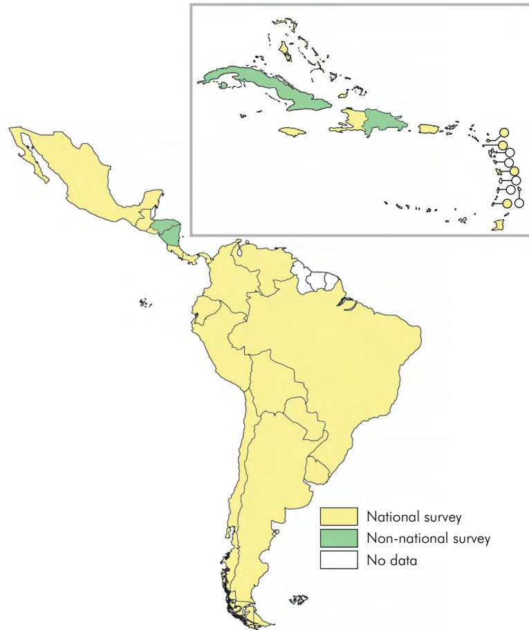
Figure 1. Representativeness of epidemiological studies in Latin American and Caribbean countries.

The national surveys of children and adolescents in Colombia were performed in 1998 and 2014, and a reduction in the prevalence of caries (from 2.30 to 1.51) was observed among 12 year old adolescents over this time period. 27,28 A similar reduction in caries prevalence was also observed in the same age groups in Chile in 1992 and 2007, 29 and in Paraguay in 1999 and 2008. 30 The 1997 National Survey in Bolivia reported a dmft score of 7.9 among 6 year old children and a DMFT score of 4.7 among 12 year old adolescents, while the most recent national survey conducted in 2015 reported a slight decrease in these scores (dmft: 7.2, DMFT: 4.6). 31 Similarly, Guatemala 32 reported a DMFT score of 4.51 and 6.88 in the 12 and 15 year age groups, respectively.