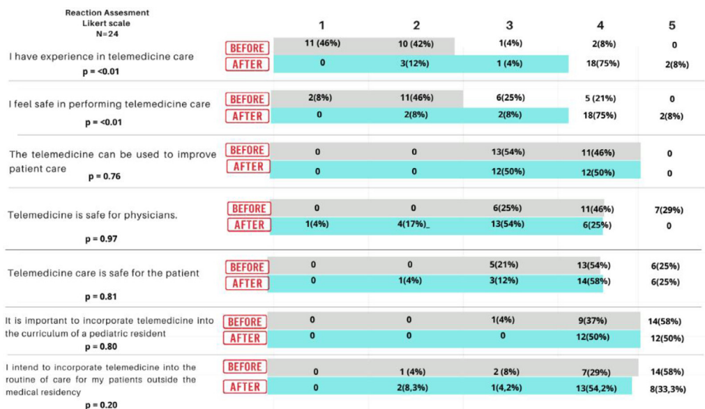
Fig. 3. Reaction Assessment before and after the rotation. Likert Scale (1- Strongly disagree, 2- Disagree, 3- Indifferent, 4- Agree, 5- Strongly agree). The bar graph indicates the mean value of each response (see Table 1 for values).

assessment at the end of the first 3 weeks of training and teleconsultations. The perception questionnaire was answered by the 40 residents.