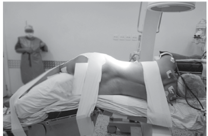
Figure 1. Positioning of the patient on the surgical table.

The discectomy is then performed using pituitary forceps and curettes. Execution of a contralateral annulotomy is indispensable. (Figure 3)