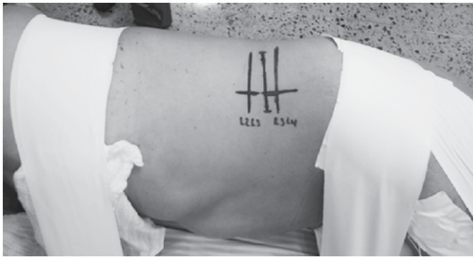
Figure 2. Marking of the levels and of the single skin incision between the two levels to be operated.