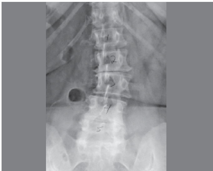
Figure 1. Simple X-ray of patient with degenerative scoliosis.

It is extremely important to bear in mind factors such as osteoporosis, as these have an effect on the ability of the bone-metal interface to support the “cantilever” forces present at the caudal extremity of the spinal structure. 1,2