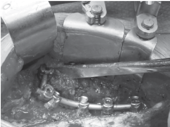
Figure 4. Transsurgical photograph of a construction through lumbopelvic fixation. Note the rod connecting to the iliac screw.

The approximate surgery time was 5 hours, SD 1 and there was average bleeding of 1380, SD 178. (Table 1).