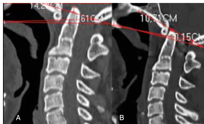
Figure 1. Sagittal section of computed tomography before (A) and after (b) indirect decompression by atlantoaxial facet distraction with PEEK cage. The lines of McGregor, Chamberlain and McRae prove caudal migration and realignment of the odontoid process.

Originally, the technique of Goel used a stainless steel cage to maintain the craniovertebral realignment, together with autologous graft of the posterior iliac crest. 1 In our cases, we used a polyetheretherketone (PEEK) cage, as we believe it has some theoretical advantages: lower subsidence rate, higher consolidation rate, and better visualization in imaging examinations during postoperative follow-up. The aim of this work is to carry out a retrospective clinical and radiological examination of the results of atlantoaxial facet distraction using PEEK cage in the treatment of basilar invagination.