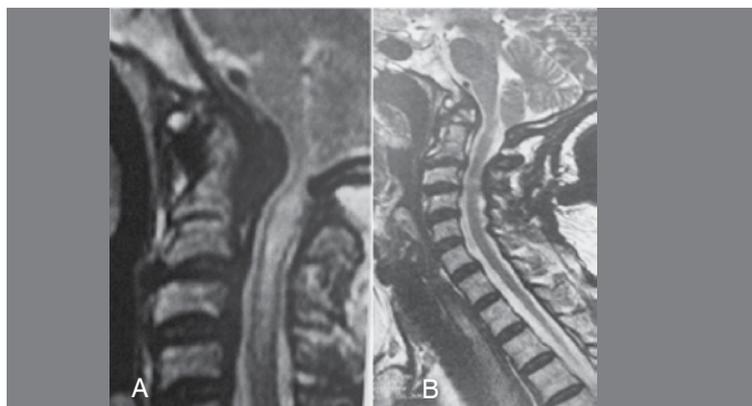
Figure 4. Preoperative sagittal T2-weighted MRI scan showing basilar invagination, retro-odontoid pseudotumor, and syringomyelia (A). Postoperative sagittal T2-weighted MRI scan performed 3 months after surgery showing a reduction in basilar invagination, syringomyelia and buckling (B).

The occurrence of neuropathic pain in 50% of our patients, which we attributed to the resection of the C2 ganglion for visualization and exposure of the atlantoaxial joints, was a relevant clinical complication, and does not coincide with the proportion of this complication in other, larger series described in literature. 16,23 On the other hand, our small series does not allow us to establish the real incidence of this complication.