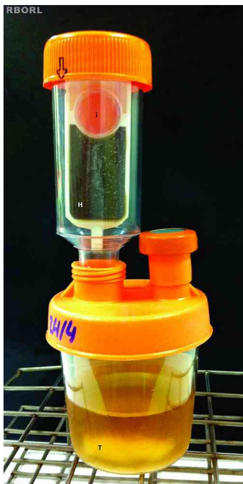
Figure 5 System after the end of the incubation period. Nasal packing (T) inside the container of supplemented broth, CO 2 indicator (i) with a strong pink color due to the presence of micro-organisms and chocolate agar medium (H) with the presence of bacterial colonies.

The nasal packing was placed inside the container with the broth, soon after its removal from the nasal cavity of the rabbit, followed by occlusion of the container. For each nasal packing removed, one Pediatric Hemovac Triphasic® system was used. This was gently shaken for homogenization of the sample with the broth. The material was kept for 72 h at room temperature with no sunlight exposure or manipulation of the material. The system was repositioned at the original position so that all the liquid medium would return to the bottom of the container. All materials were again incubated at 35 \pm 2^\circ\text{C} and observed twice daily for colony identification and/or change in the CO 2 indicator (Fig. 5).