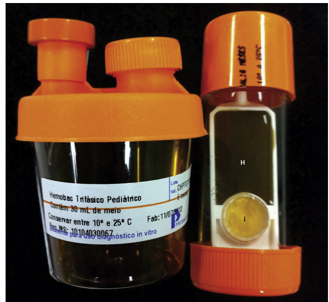
Figure 4 Container with supplemented broth to the left and dipslide to the right. Dipslide side consisting of chocolate agar (H) and CO 2 meter (i).

Hemobac® in the same microbiology laboratory. The Hemobac Triphasic® System is a product used in cultures of blood and blood components, stem cells, body fluids, and parenteral nutrition; in the present study, the Pediatric Hemobac Triphasic® system was used. The system consists of two elements: a plastic container containing 30 mL of broth supplemented with yeast extract and sodium polyanethol sulfonate (SPS) and a dipslide (Fig. 4). The latter has two faces: a broad face, consisting of chocolate agar and CO 2 indicator to detect bacterial and/or fungal growth, and a divided face, consisting of Sabouraud agar and MacConkey agar.