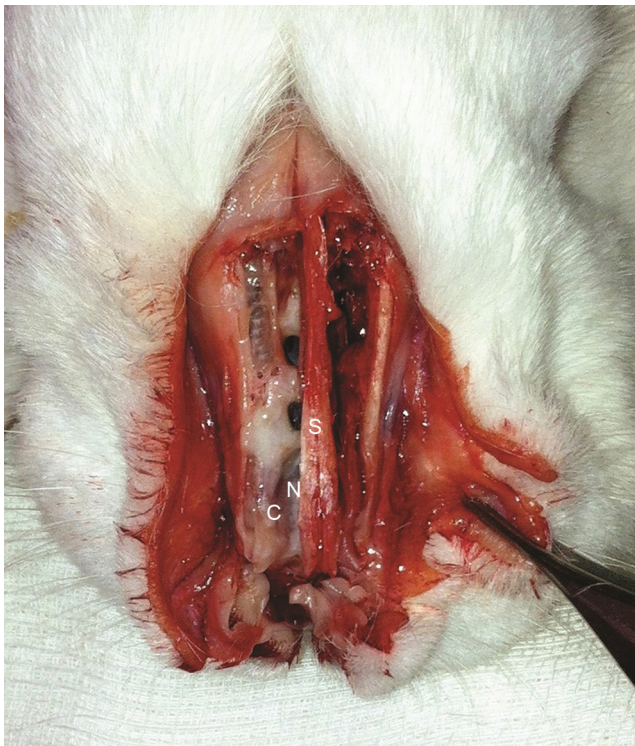
Figure 1 Outer wall of the open sinonasal cavities, exposing the maxillary sinuses and nasal cavity. Evident infectious process on the right, characterized by mucosal edema and purulent discharge. Anatomical sites represented by the maxillary sinus (M), nasal septum (S), inferior turbinate (T), and nasal cavity (N).

was evaluated according to its intensity, classified as absent, present, or severe (Figs. 2 and 3).