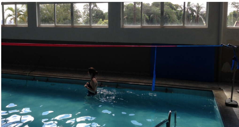
Figure 1. Three-minute walk test in water (3MWT-W)

The test was conducted at least two hours after meals. Participants were told to use their own, comfortable clothing to the aquatic environment. Prior to the test, they maintained 10 minutes of rest, during this period their PA, level of dyspnea and lower limb fatigue using a modified Borg scale 20 , SpO 2 and HR were evaluated. The maximum heart rate was calculated according to the of Karvonen formula (220 - age) 22 .