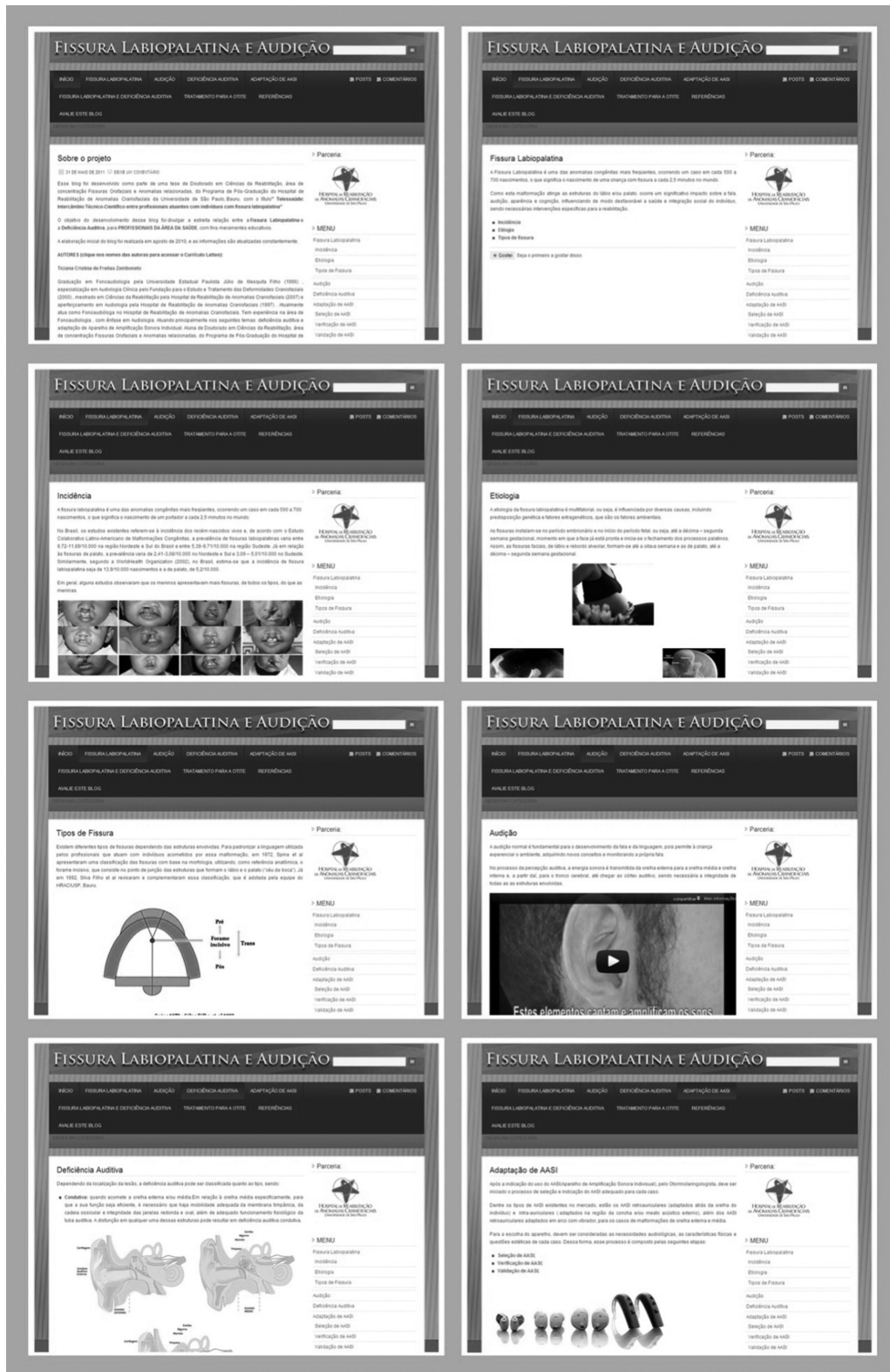
Fig. 1 Blog Fissura Labiopalatina e Audição (Cleft Lip and Palate and Hearing) internal pages with hypertext, images and videos.