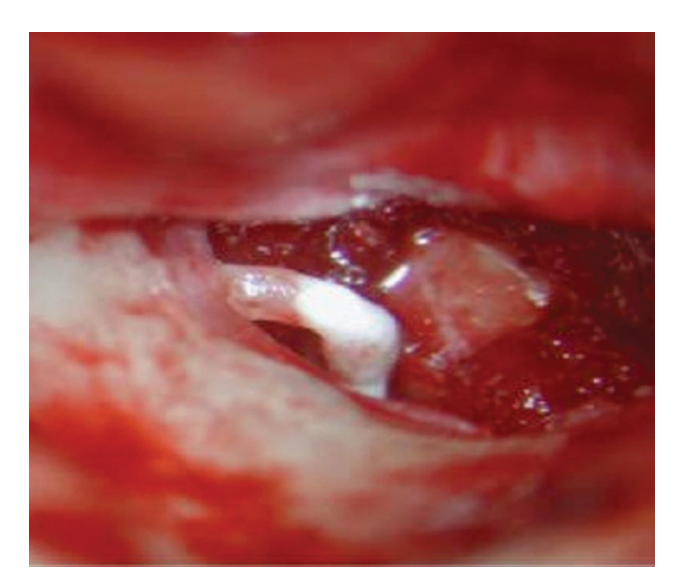
Fig. 1 Glass ionomer cement reconstruction of the right incudostapedial joint

The present study was conducted on 27 patients with ages ranging from 13 to 55 years old; 15 of them were female and