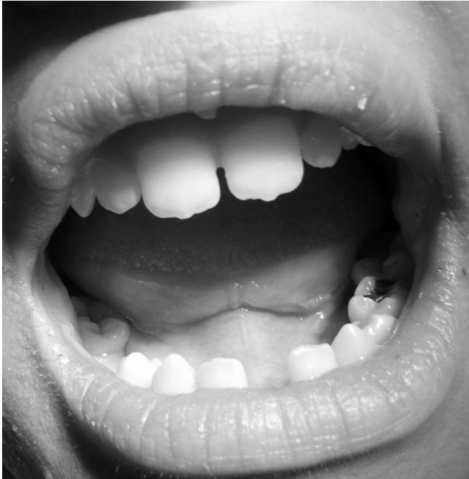
Figure 4. Dental alterations; key features of ED patients showing serrated maxillary incisive teeth.