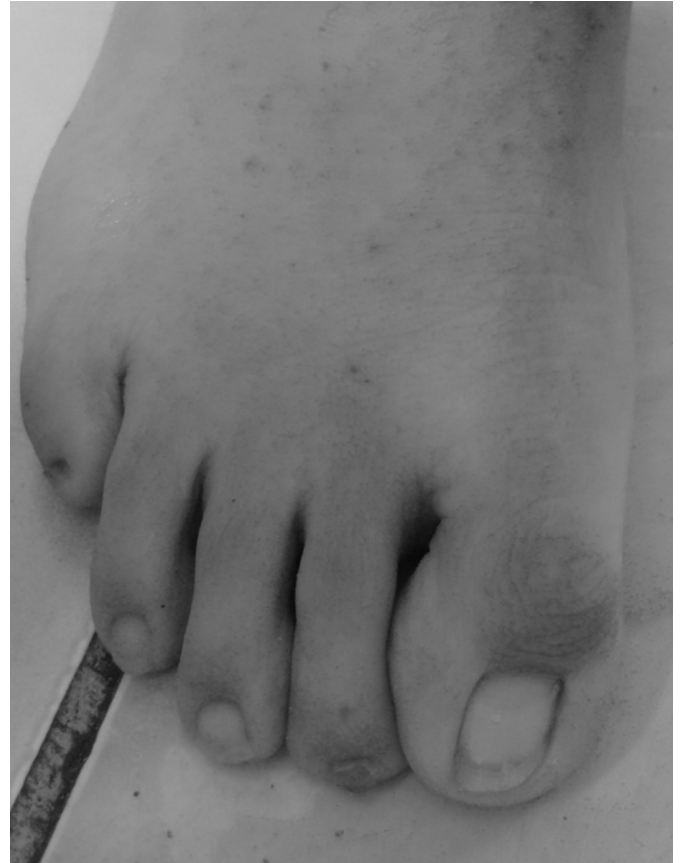
Figure 2. Thick and brittle nails key features of an ectoderm dysplasia patient.