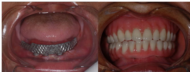
Figure 3. Postoperative of 2 days, metallic superstructure and hybrid prosthesis type protocol installed.

protocol-type hybrid prosthesis made with metal and acrylic superstructure were installed with the appropriate occlusal adjustment. All patients received also complete upper dentures (Figure 3).