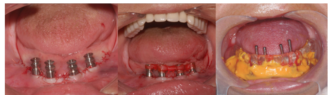
Figure 2. Adaptation of mini-piers on implants and molding with open molders.

All surgical procedures were performed under local anesthesia by the same surgeon. The implants were placed following a standardized surgical protocol and using previously prepared surgical guides. After installation of the implants, mini-abutments were adapted over them, and then transferred by molding with open molders (Figure 2).