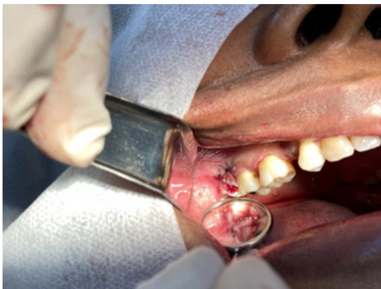
Figure 3. Exodontia of the DU 18 - Suture with primary closure of the alveolus.

For the surgical procedure, after intraoral (chlorhexidine 0.12%) and extraoral (chlorhexidine 2%) antiseptis, infiltrative anesthesia with lidocaine 2% and epinephrine 1:100,000 was used. In the region of tooth unit 18, a buccal flap was necessary for the primary closure of the alveolus (figure 3). The exodontia procedure occurred uneventfully, and the surgical sites were irrigated with 0.9% saline solution and sutured with 5-0 nylon (figure 4) and (figure 5).