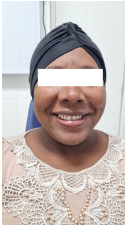
Figure 1. Extraoral photograph of the patient during the first visit with visible volume increase on the right side of the face.

(without the antagonist tooth) with an extensive caries lesion and signs of a progressing abscess. Radiographic evaluation (panoramic) revealed a thickening of the periodontal space of tooth 18 with the respective carious lesion clinically visualized and the presence of residual roots corresponding to teeth 15 and 24 (figure 2).