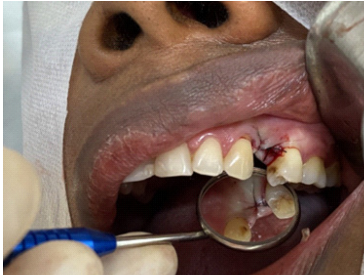
Figure 5. Exodontia of residual roots 24 - Sutured alveoli after exodontia of residual root.

In the figure 6 is visualized DU 18 and residual roots 15 and 24 extracted.