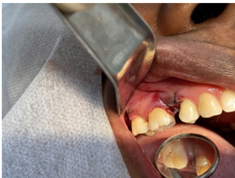
Figure 4. Exodontia of residual root 15 - Sutured alveoli after exodontia of residual root.