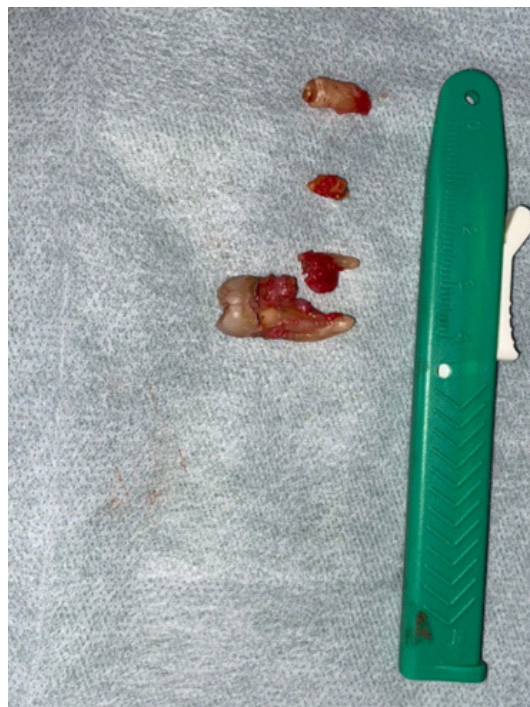
Figure 6. DU 18 and residual roots 15 and 24 extracted.

The prescribed postoperative medication consisted of amoxicillin 500 mg every 8 hours for 7 days, Ibuprofen 600 mg every 8 hours for 3 days, and dipyron 500 mg every 6 hours in case of pain. After removing the suture and verifying the epithelialization of the dental alveoli, which was within normal standards, the patient was referred to continue the oncologic treatment with follow-up by the HU/UFS Hospital Dentistry Team.