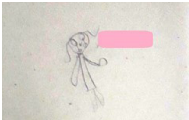
Figure 3 – Drawing made by C3. 8 years old

I feel sad, because I want to go home, but I can't. I need to be treated. But I have to be treated first and then leave hospital. And I will never come back. Crying, here are the tears (pointing to the drawing that represents her with tears going down her face). (C3)