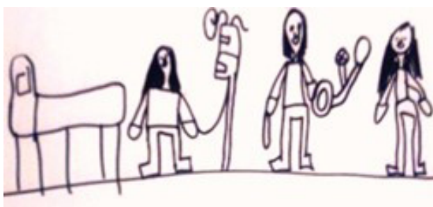
Figure 1 – Drawing made by C9. Seven years old

Based on C9's interpretation of the drawing, it can be seen that she recognizes the health professional and the actions taken by other professionals, who come to "check her vital signs". Moreover, she recognizes herself in one of the hospital routines, such as the infusion of saline solution.